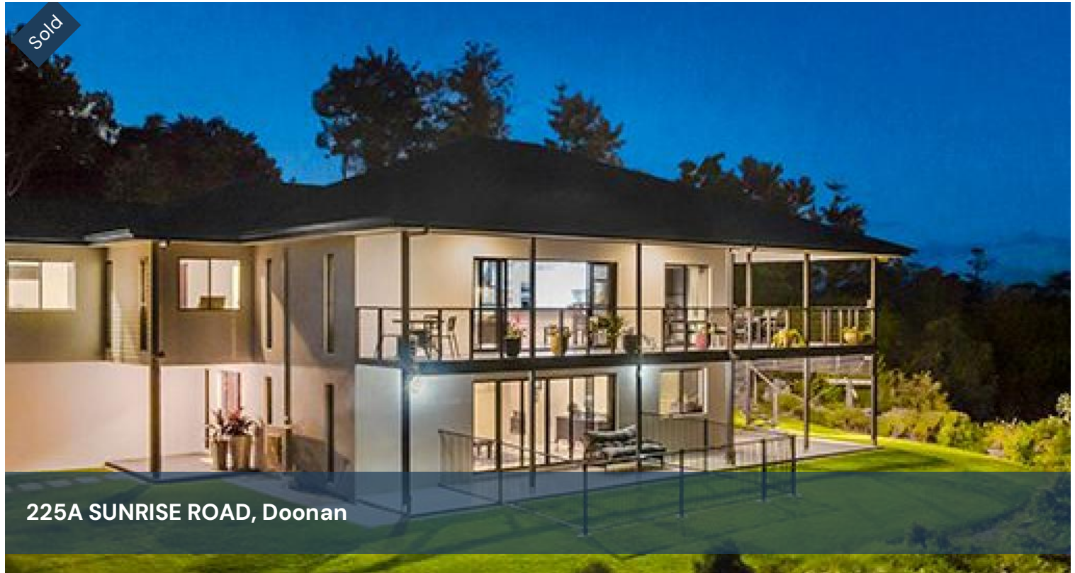
225A SUNRISE ROAD, Doonan