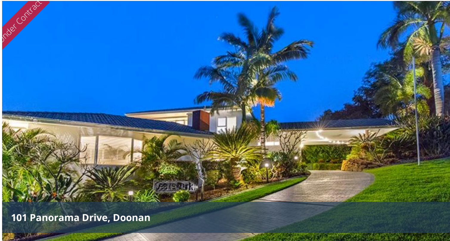
101 Panorama Drive, Doonan