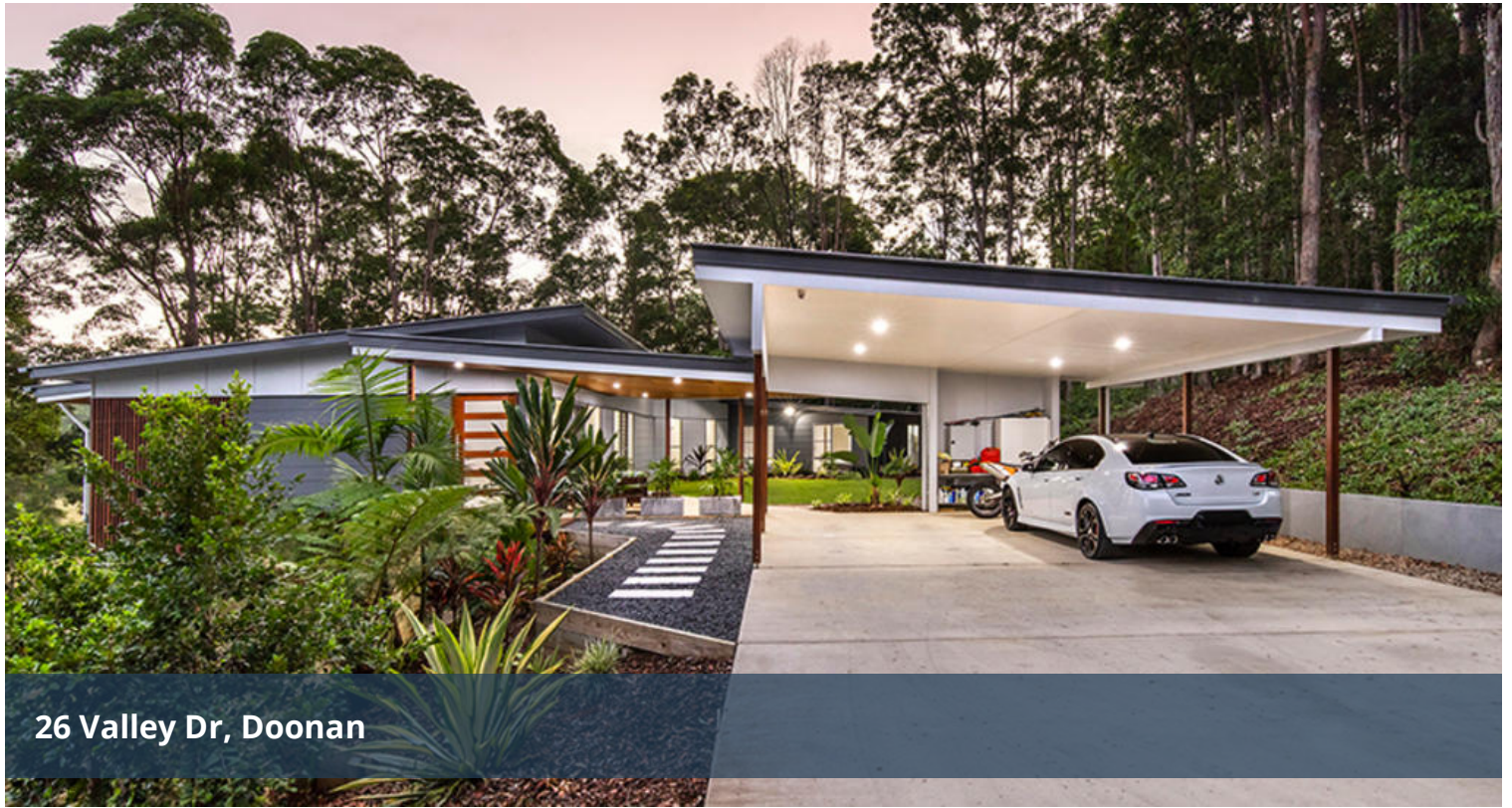
26 Valley Dr, Doonan