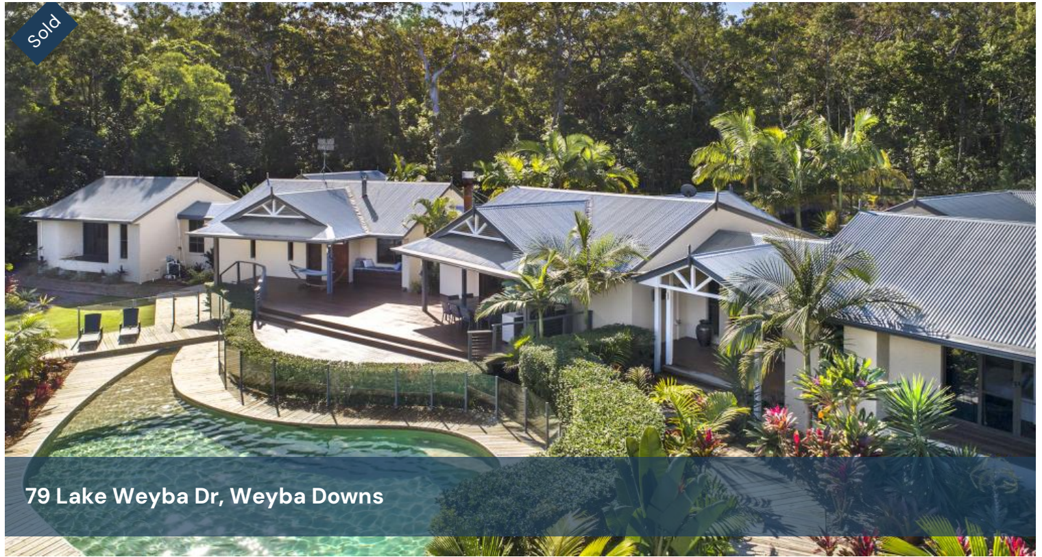
79 Lake Weyba Dr, Weyba Downs