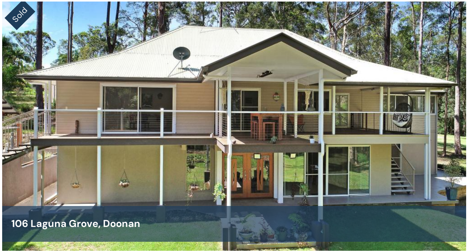
106 Laguna Grove, Doonan