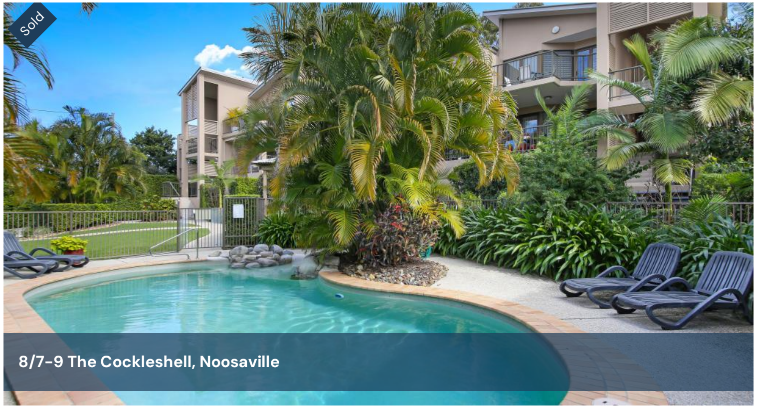
8/7-9 The Cockleshell, Noosaville